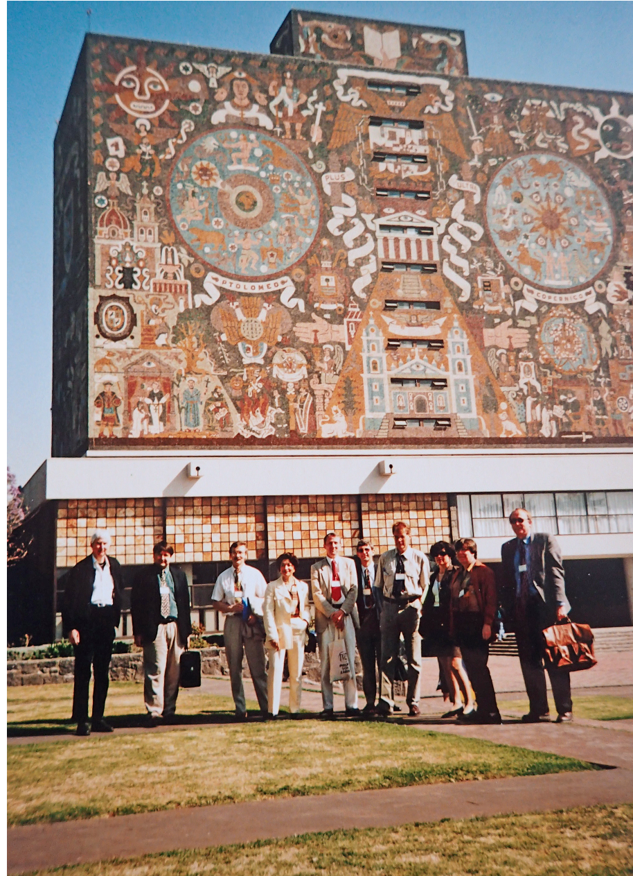
Fig. 3: Outside Universidad Ciudad, Mexico City, 1998.